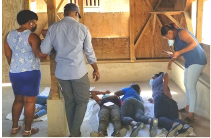
Doctors and nurses at the CCH Primary Care Clinic practice patient triage skills

In the last year, CCH has welcomed new healthcare staff, including a new Primary Care Nurse, a new Director of Physical Therapy, and 3 School Nurses. Everyone (old and new) has been building their skills to provide excellent patient care.