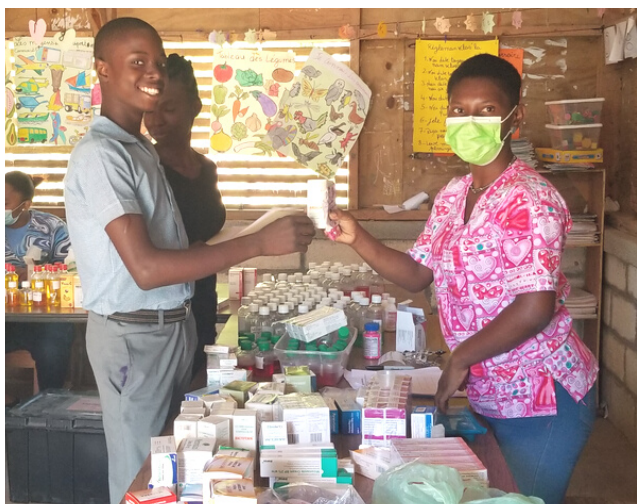
TOP LEFT: Diedyson distributes hygiene kits. TOP RIGHT: Ninotte demonstrates how to use the Days for Girls supplies. BOTTOM: A mobile clinic nurse dispenses medication.