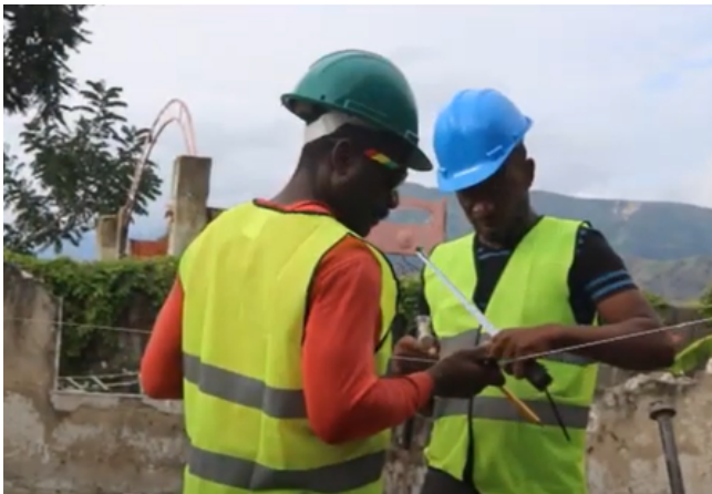
Community members and skilled volunteers in Haiti come together to rebuild.