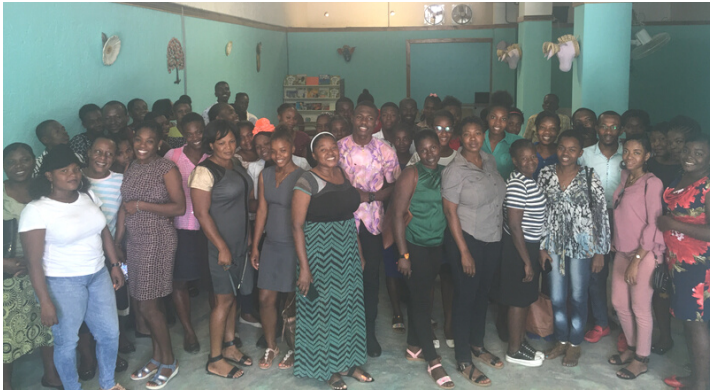
60 teachers gathered in March for a 2-day seminar on testing/evaluation, cognitive biases, and how to teach poetry across all primary grades.