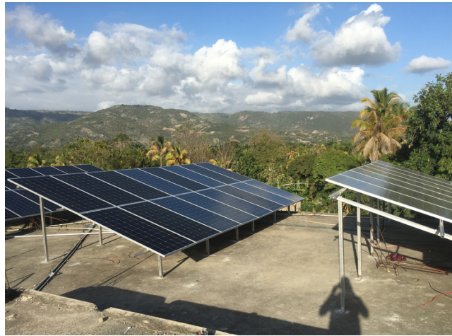
Solar panels provide renewable energy for the CCH Clinics and Program Center.

Thanks to generous donors like you, and some professional help from DigitalKap (an energy company in Port au Prince), the CCH Clinics and Program Center are now solar powered! The roof racks, solar panels, and battery bank were installed in March, supplementing batteries already in place to store excess diesel generator energy. Our staff are now trained in how to use and maintain the whole system.