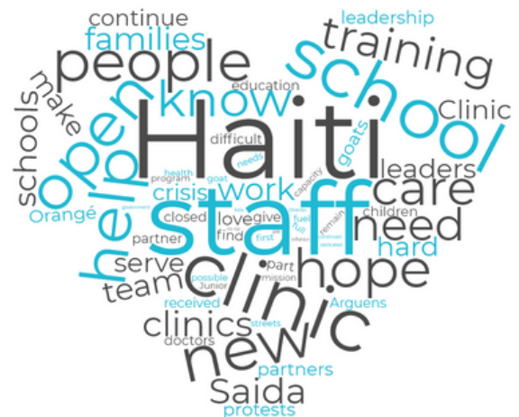
These were our most blogged about words in 2019.